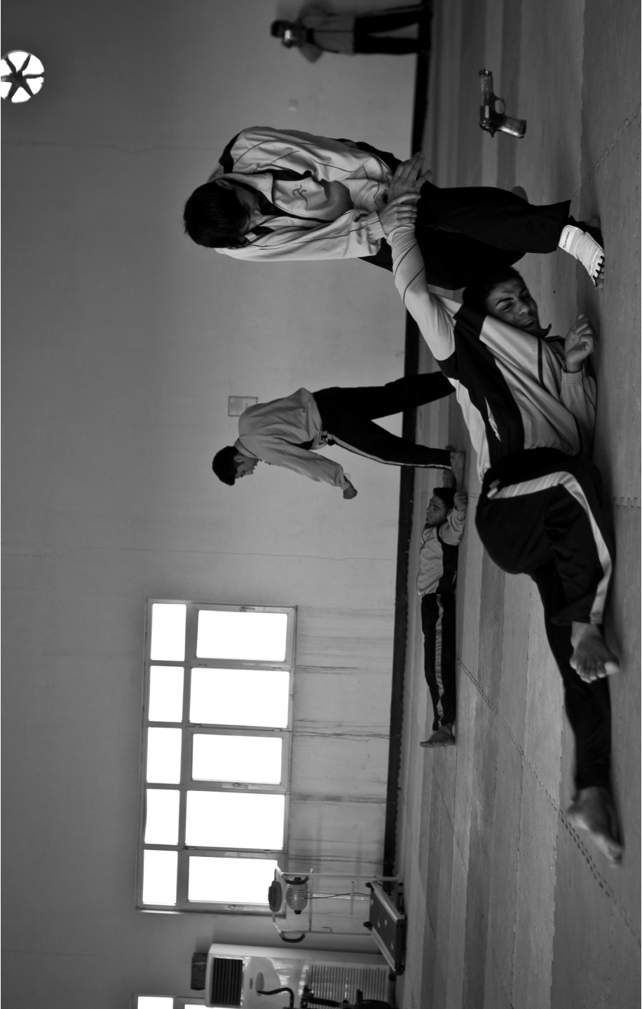
Zerevani soldiers practice hand-to-hand combat. The Zerevani, like the rest of the Kurdish military and government, are transitioning from fighting in the mountains to organizing a region and providing regular services and support.