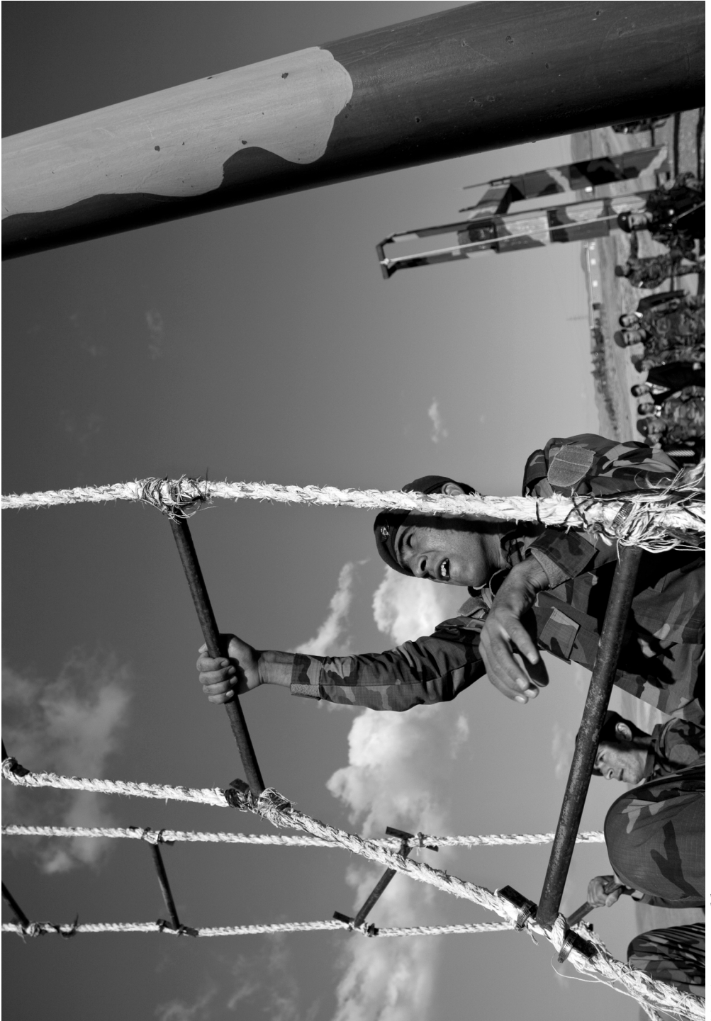
Two Zerevani soldiers on a training course.