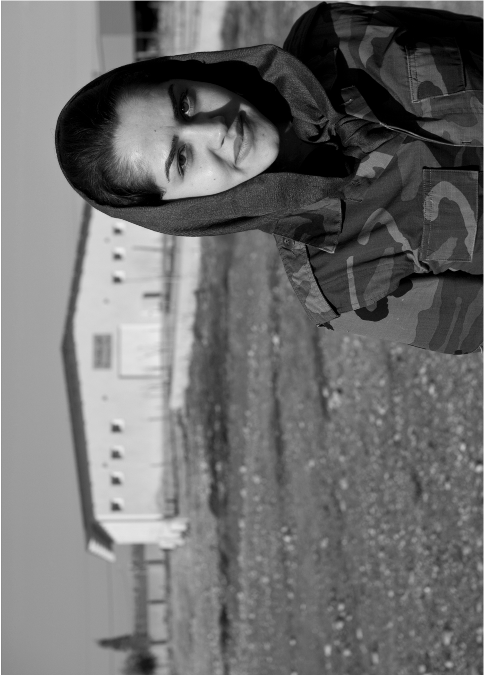
Portrait of a female Zerevani soldier.