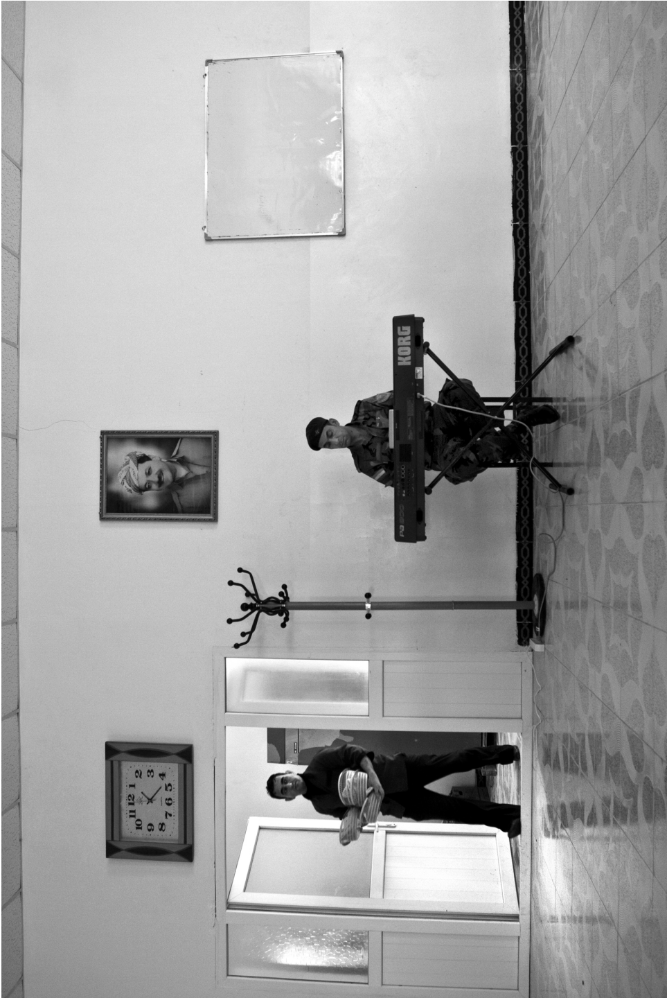
A Zerevani soldier plays an electric piano in the dining hall of a base outside Erbil. A portrait of Iraqi Kurdistan President Masoud Barzani hangs on the wall above the soldier. The Zerevani Special Forces are part of the Kurdish peshmerga. Within the myth and lore of the peshmerga there is a sanctification of the mountains and of political figures such as Mullah Mustafa Barzani, father of the current president.